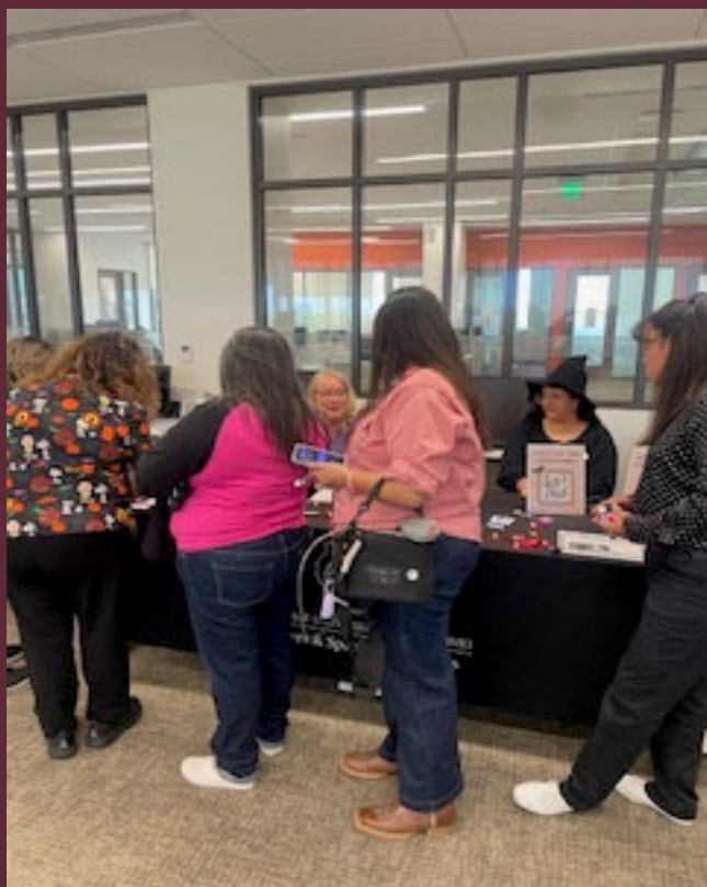
“Haunted History Time at the Archives” on October 29, 2024.