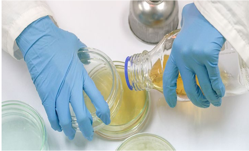
Figure 2. Pouring plates should occur when the glass is cool enough to touch, but not too cool where the agar has solidified.